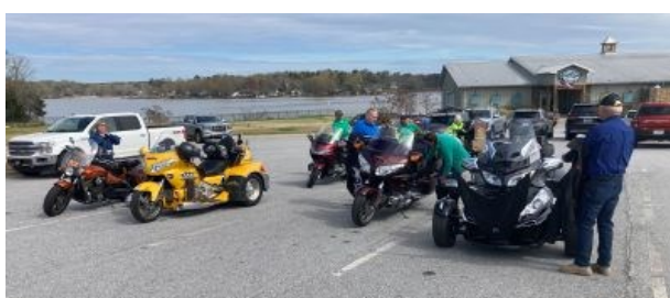
4th: Blessing of the Bikes, Greenwood 5th: Retiree Ride, McCormick 6th: Camping, Kings Mountain State Park