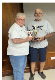
Top: Trip to Flanigan's in Aiken