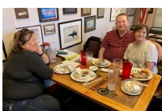
7th: Chapter Dinner -Flight Deck