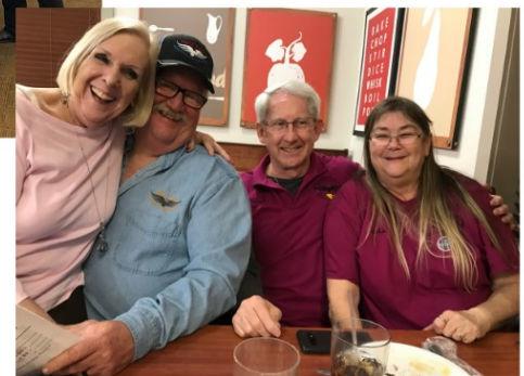
Chapters H, P & F