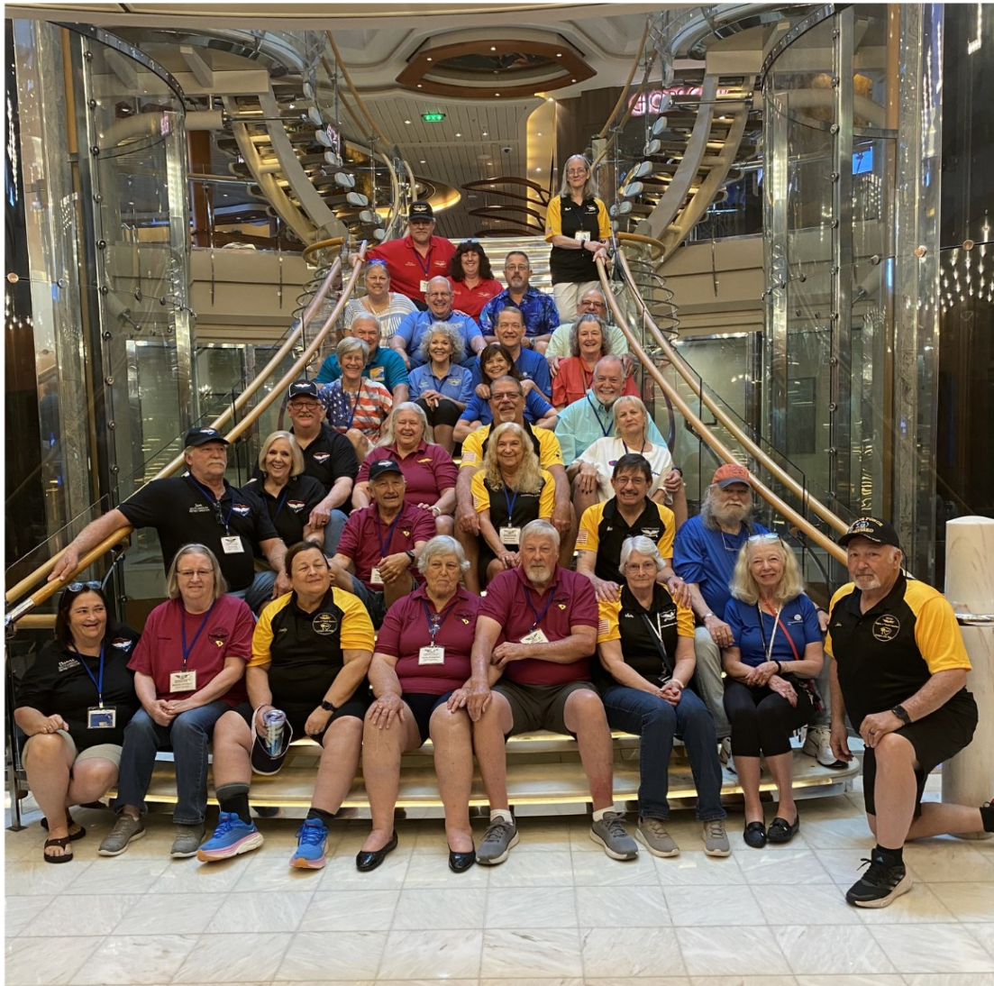
9th Wingers-N-Waves SC Members