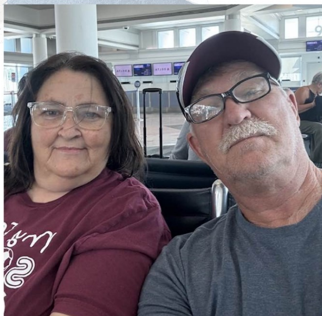
Waiting at the airport to fly to Green-bay

District Facebook Page https://www.facebook.com/ewma.sc