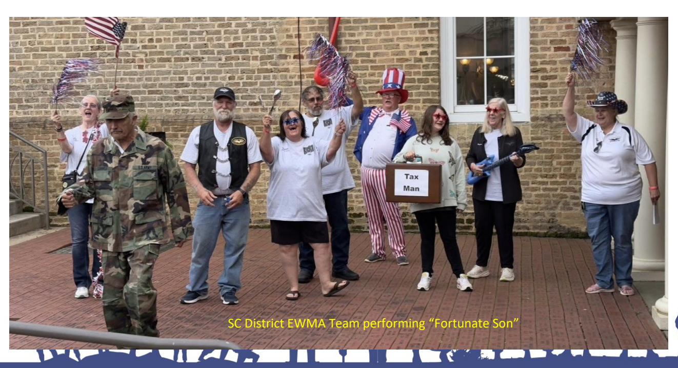
Tribute to our Troops